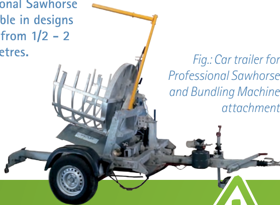
Fig.: Car trailer for Professional Sawhorse and Bundling Machine attachment